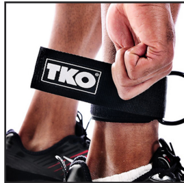
106 ANKLE STRAP