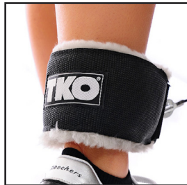
106H ULTIMATE ANKLE STRAP